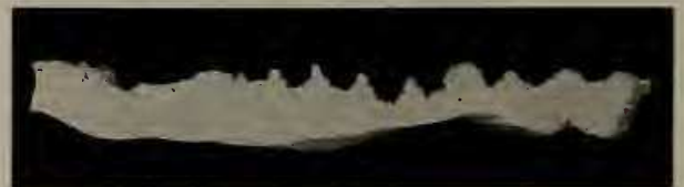
Figure 4. Longitudinal profile of the pedicle valve of Leptodus nobilis (Waagen, 1883). Right lateral view of a section of the latex cast, showing the lateral septa, NU-B128. ( \times 2 )

The single lyttoniid specimen figured by Ozawa (1927, pl. 45, fig. 12) as Lyttonia richthofeni Kayser from the lower part (Same Zone of Wakimizu, 1902) of the Akasaka Limestone is clearly distinguished from the present species by its grooved (angustilobate) lateral septa in the pedicle valve, which is the diagnostic character of the genus Eolyttonia Fredericks,